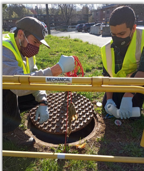
Two members of the University of Massachusetts, Amherst wastewater surveillance team collecting a sample for the lab from one of the on-campus collection sites.